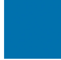
Blue Sky - 21 (BLS)